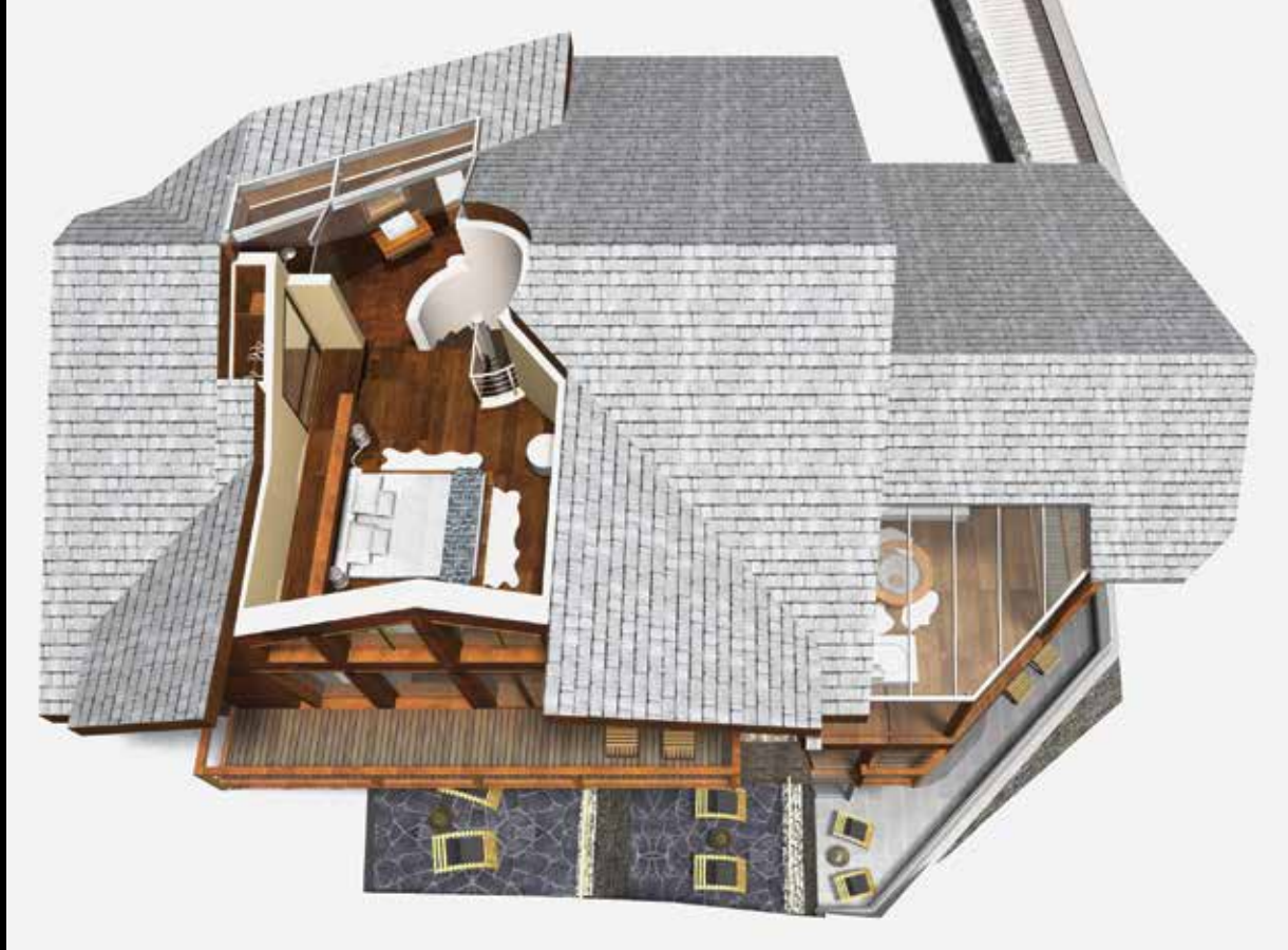
TOP FLOOR PLAN Total Internal Area 34.47 m 2

3D renders are artist impressions and are therefore for reference only.