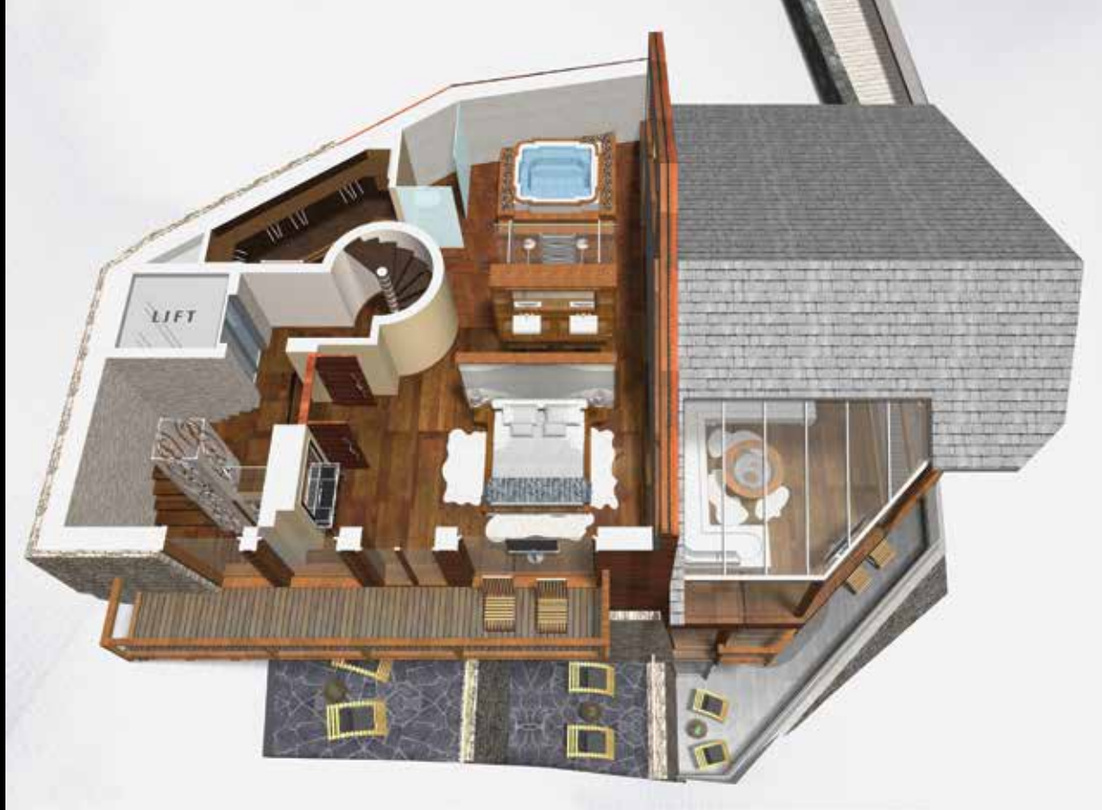
THIRD FLOOR PLAN Total Internal Area 90.11 m 2 Total External Area 10.76 m 2