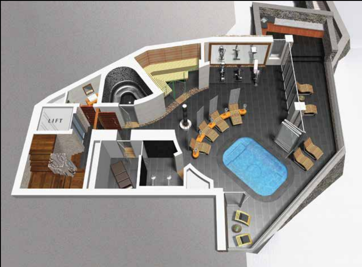
GROUND FLOOR WELLNESS PLAN

Total Internal Area 72.50 m 2 Total Technical Area 71.09 m 2