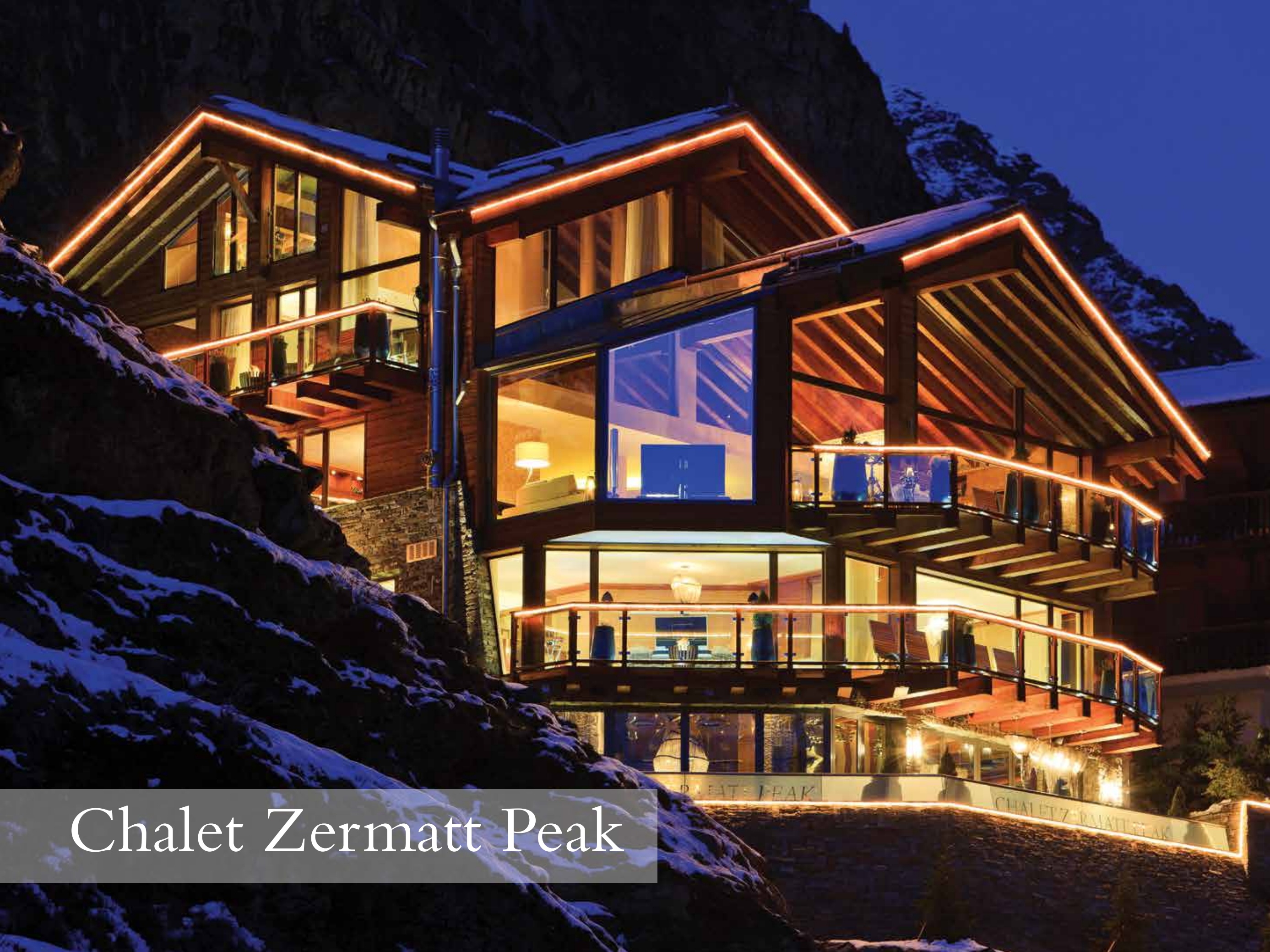
Chalet Zermatt Peak