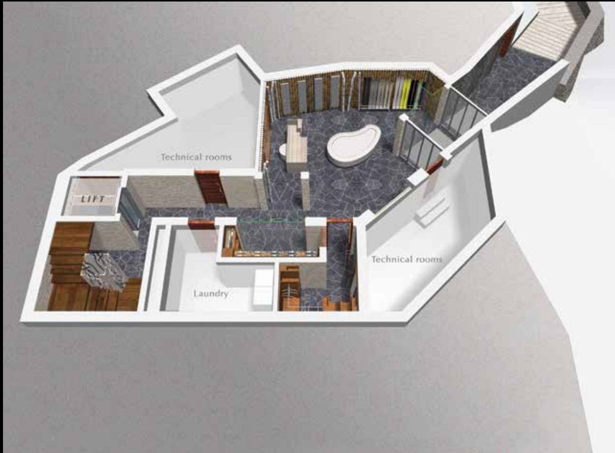
BASEMENT LEVEL AND ENTRANCE PLAN

Total Internal Area 72.50 m 2 Total Technical Area 71.09 m 2