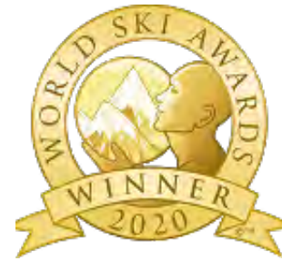
Switzerland's Best Ski Chalet

It is one thing to have an amazing property, however it needs a great team to make it exceptional. At its heart, Chalet Zermatt Peak is about unrivalled personalised service. We are proud to have our team recognised for delivering our clients an amazingly personalised experience, time and time again.