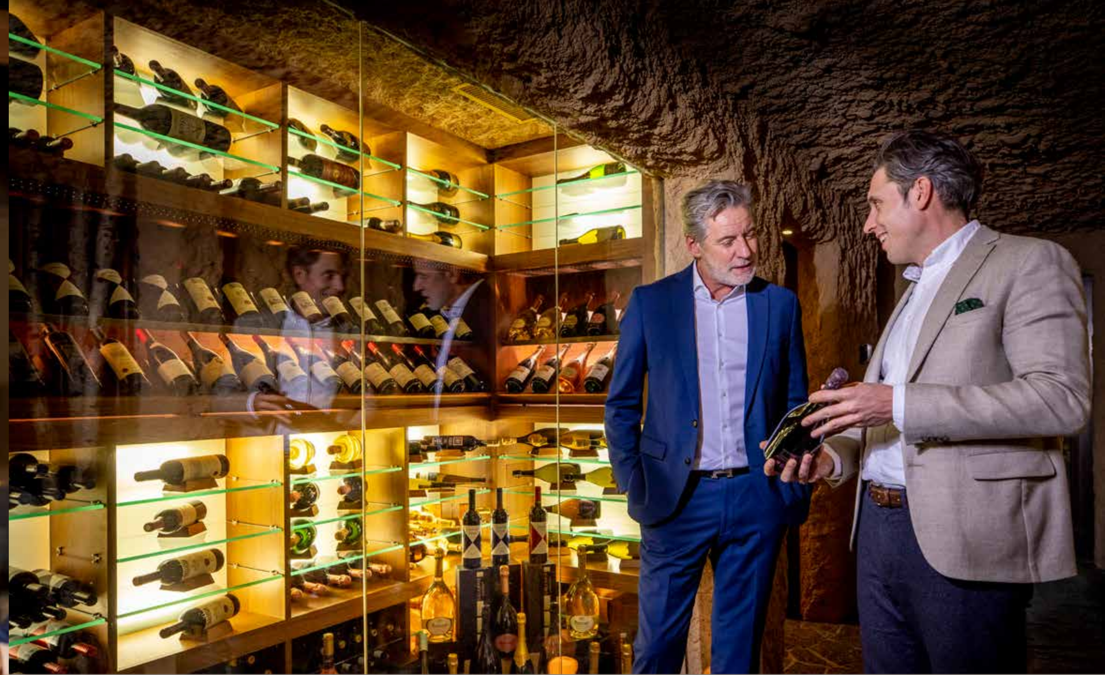
The Chalet Zermatt Peak wine collection is one of the finest private collections in Zermatt.